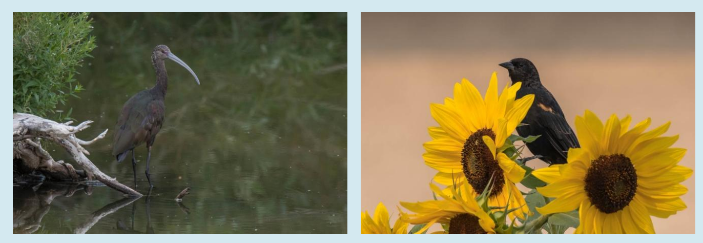
September and October 2021 photo contest winner Janet Busi - White-faced Ibis and Red-winged Blackbird