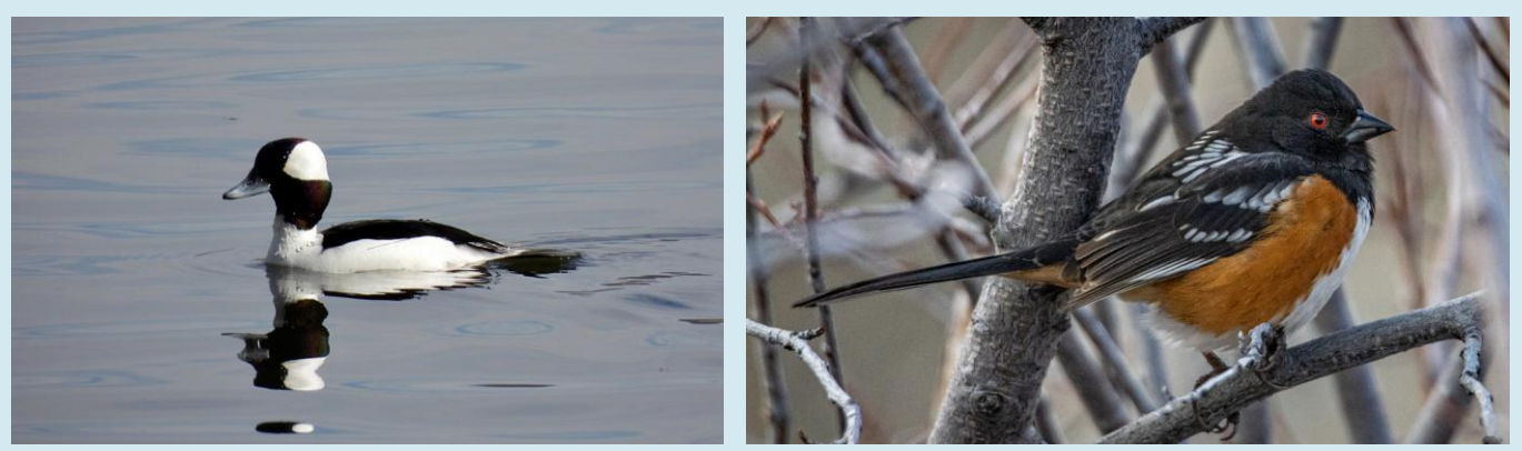
March 2021 photo contest winner Emma Wynn – Bufflehead reflection, and April 2022 photo contest winner Brian Meltzer – Spotted Towhee