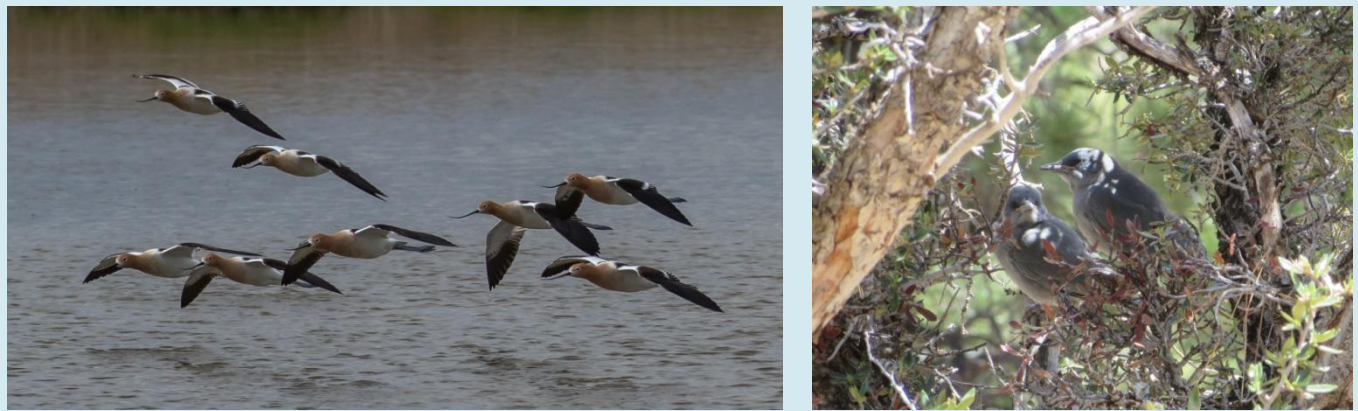
Spring 2022 photos: American Avocets at Stillwater NWR and Pinyon Jay fledglings in Reno.

This fiscal year, we coordinated with National Audubon Society, Stillwater National Wildlife Refuge, and Nevada Department of Wildlife to conduct volunteer shorebird counts in the Lahontan Valley Wetlands near Fallon, NV. These wetlands are part of the Western Hemisphere Shorebird Reserve Network, which identifies key sites important for shorebirds and shorebird conservation. Our volunteers helped agency biologists collect count data used to better understand shorebird habitat use and to inform wetland management for bird conservation. To read more about this effort, check this link on the <u>National Audubon Society page</u>.