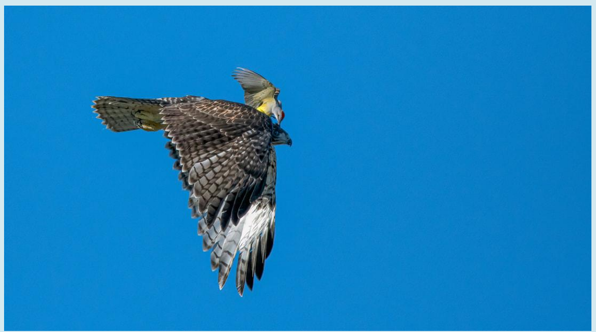
July 2021 photo contest winner Rick Mosher - Western Kingbird and Red-tailed Hawk Chase

To preserve and improve the remaining habitat of birds and other wildlife, restore historical habitat, and educate the public, with emphasis on children, providing vision to all about our unique Nevada environments.