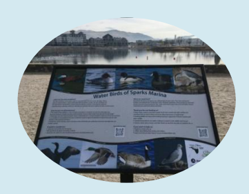
60 Birding field trips